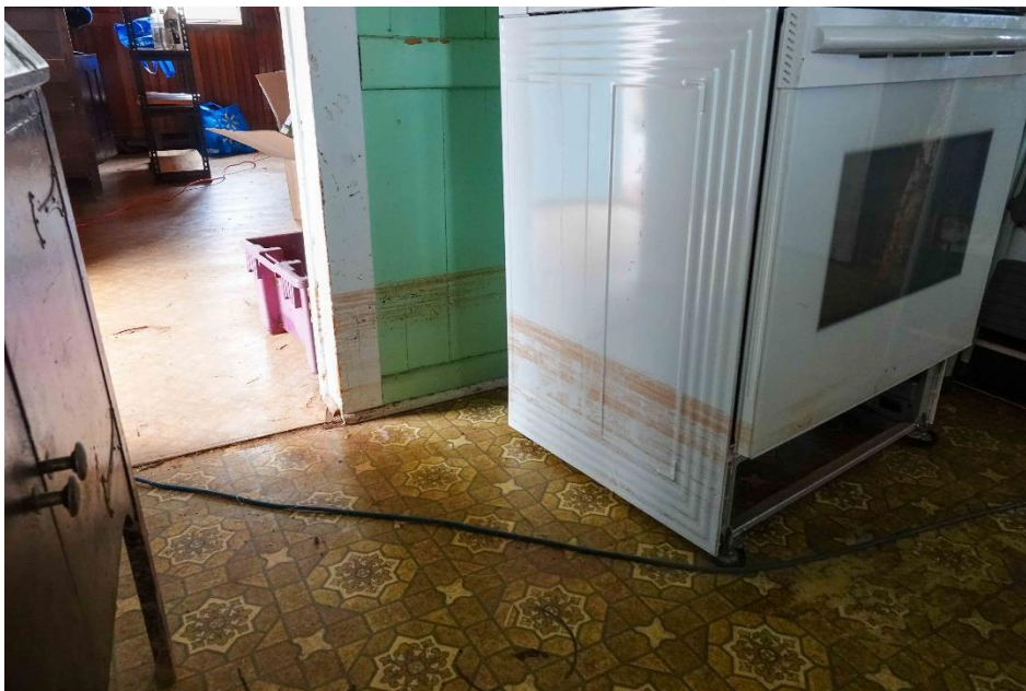
Figure 3: Watermark on wall and Kitchen Range of Court Home after Fiona Sept. 2022

During Post Tropical Storm Fiona on September 23 and 24, 2022, the Court Home experienced severe flooding with water reaching a level of 12 inches above the floor in the kitchen. This resulted in Emard Court and his housekeeper having to evacuate the house and seek shelter elsewhere.