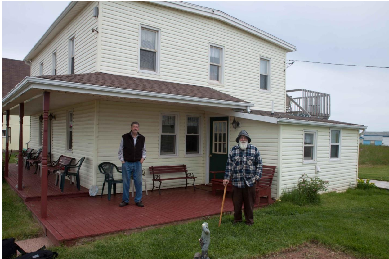
Figure 1- Vance and Emard Court - Court House

The brown house to the east is owned by their brother and is 125 years old. It was also built on wooden posts and is listing because one or more of the supporting posts has given away. The yellow house to the east is the original Court homestead and is not occupied except occasionally by members of the family.